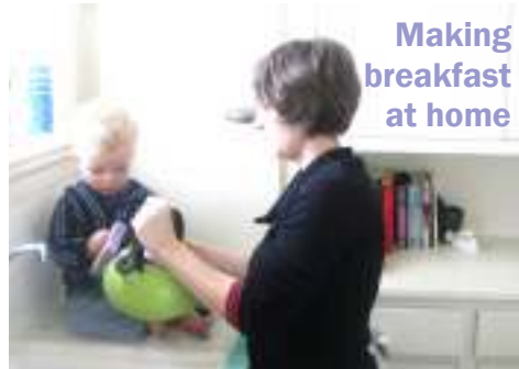
Making breakfast at home