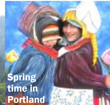
Spring time in Portland