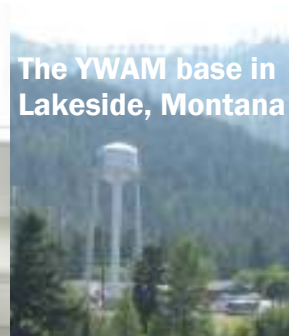
The YWAM base in Lakeside, Montana